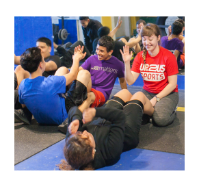
of youth report they go to their coach for advice